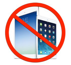
Bag that iPad! Make sure you come to school prepared with your device.